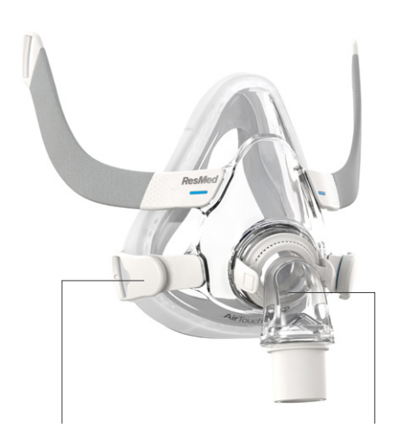
Magnetic clips guide the headgear to the frame quickly and easily.

The AirTouch F20's UltraSoft memory foam cushion adapts to the unique contours of your face, creating a seal that is designed to work across a range of therapy pressures. The AirTouch F20 has also proven to work for nearly everyone who tried it – fitting 98% of patients in a recent study.<sup>2</sup>